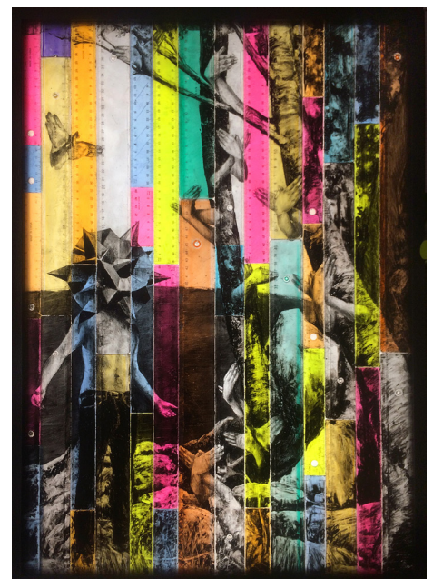
Andrea Mastrovito, The Man Who Could Work Miracles , pencil on plastic rulers, 2019. © Andrea Mastrovito

The Man Who Could Work Miracles is a tribute to contemporary stained glass. Like a twenty-first century cathedral, their stories reflect the relationship between man and nature, through a series of references to mysticism, biotechnology and the myth of Plato's cave.