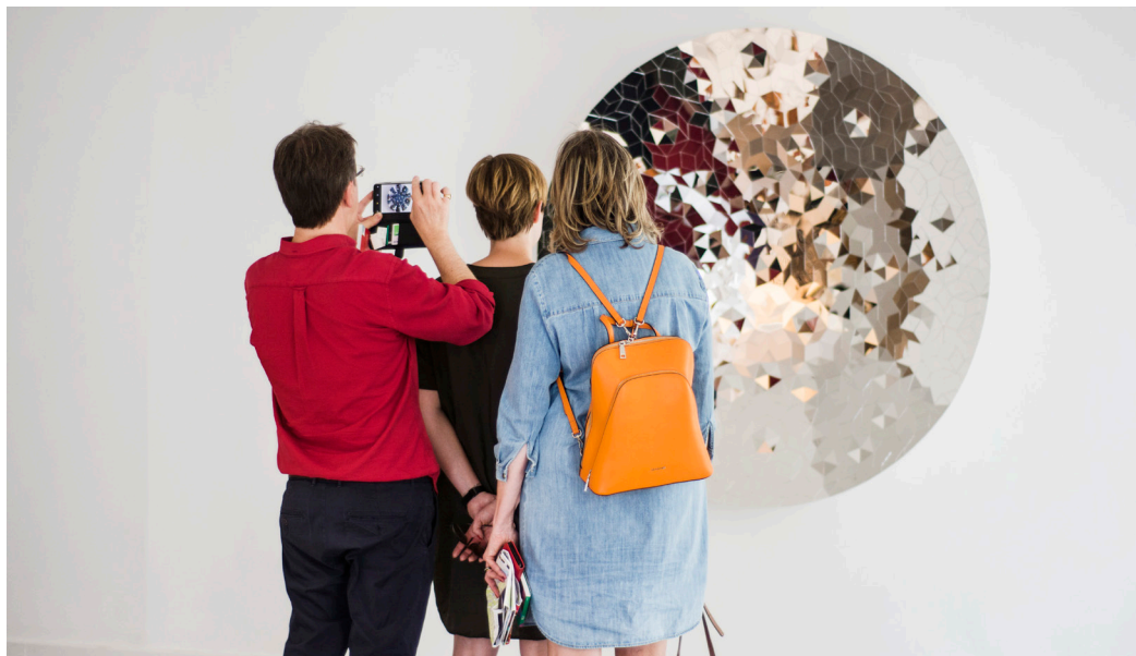
Exhibition Concert for a New Forest by Guillaume Barth, 2019. © Bullukian Foundation

Placed in the city heart of Lyon, the Bullukian Foundation's art center is a place dedicated to contemporary creation.