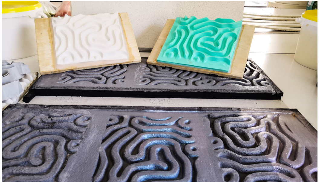
First trials of stampings into the Weber residency

The stamped coat reveals an organic architecture, reinterpreting the pattern of vermiculated stones. This pattern's shaping resumes the design of a worm's course, present in particular on the Louvre's facade.