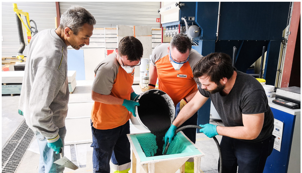
Saint-Gobain Weber residency, 2019. © Jérémy Gobé

Through the creation of a monumental installation and several sculptures, Anthropocene aims to illustrate the answers to contemporary challenges and to materialize new possibilities of construction more respectful of the environment.