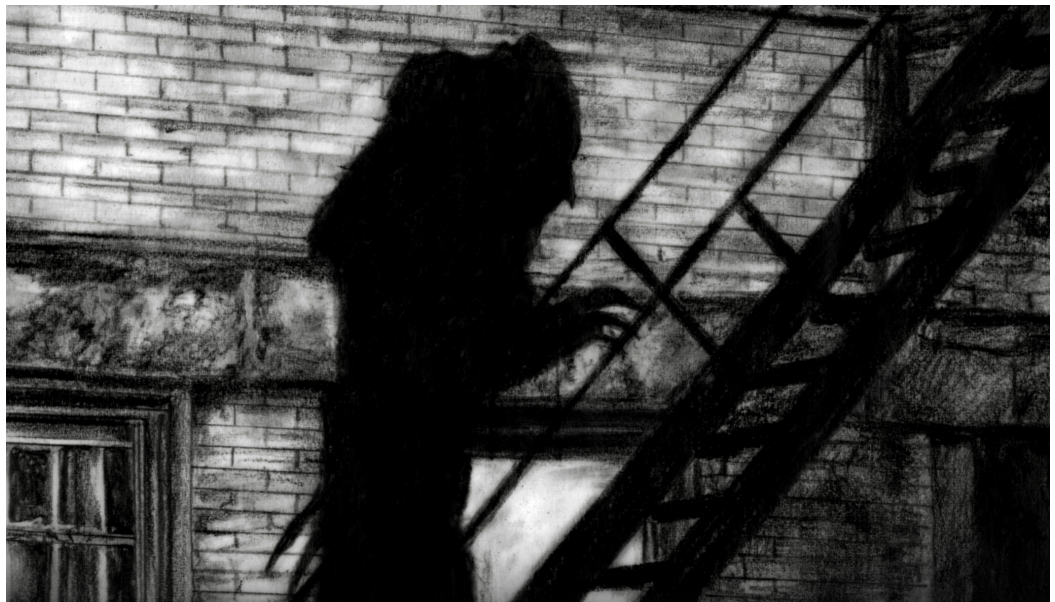
Andrea Mastrovito, NYSferatu - Symphony of a Century , rotoscopic animated movie, 65 min, 2017. © Andrea Mastrovito

The wonder and lightness present in actors' playing of the Lumière Brothers' films give way to a darker vision of our society, among modern cities in ruins, populations displacements, popular revolts and states of insurrections.