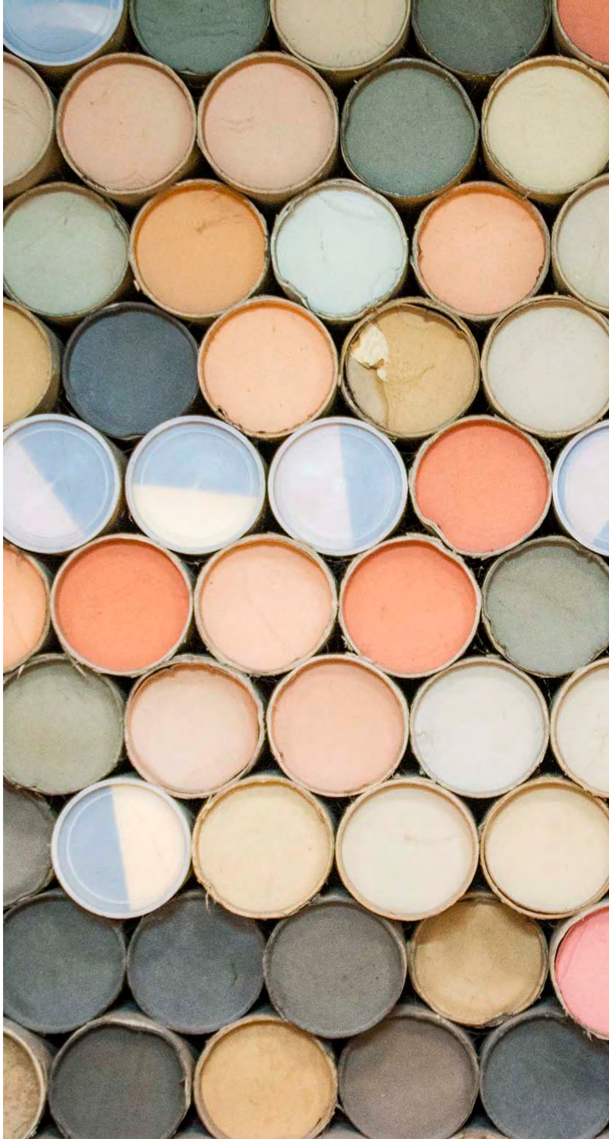
View in La Turdine dyeing works 2022 © Fondation Bullukian / La Turdine