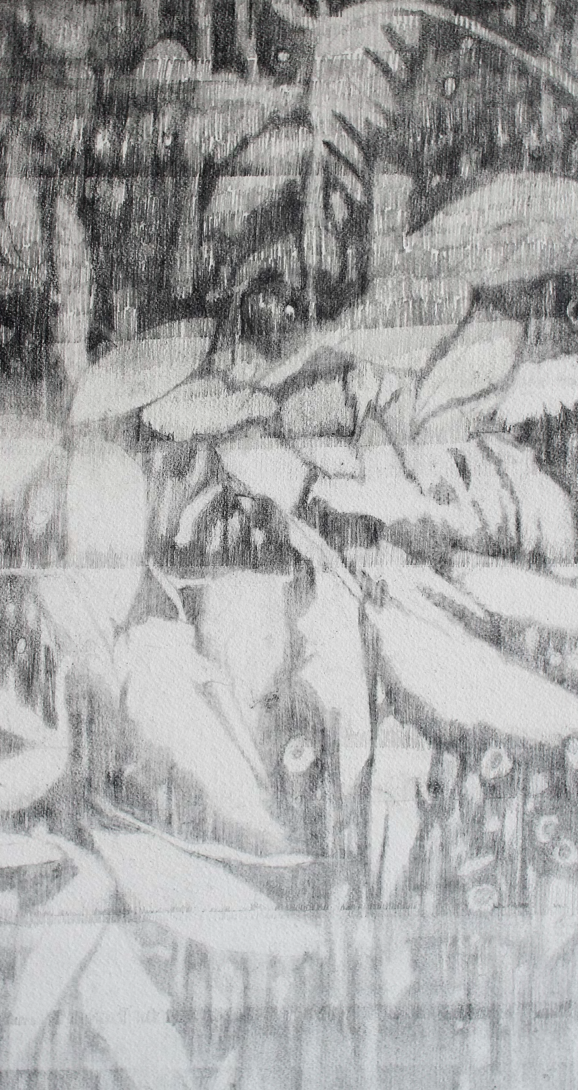
François Réau Et le feuillage (detail), 2018, graphite on paper, 50 x 30 cm © François Réau