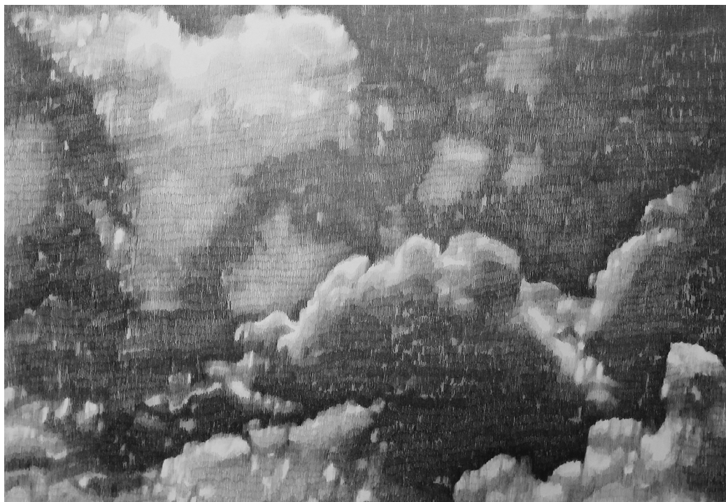
François Réau To what extent / Nuage (detail), 2022, graphite on paper mounted on canvas, 200 x 375 cm © François Réau

« This is a device in which I seek to push the limits of drawing. I wanted to propose a work that makes direct reference to Nature or to the space of the landscape but which, in a way, is a symbol of what escapes representation. It also seemed important to me to bring the viewer to have, above all, an experience of the image that could exceed him physically, and this, by giving the work a size large enough for it to lose its entity of 'object. It could thus be considered as a field of vision.