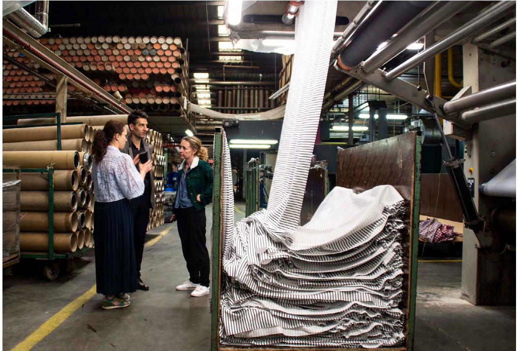
Visite at La Turdine dyeing works 2022