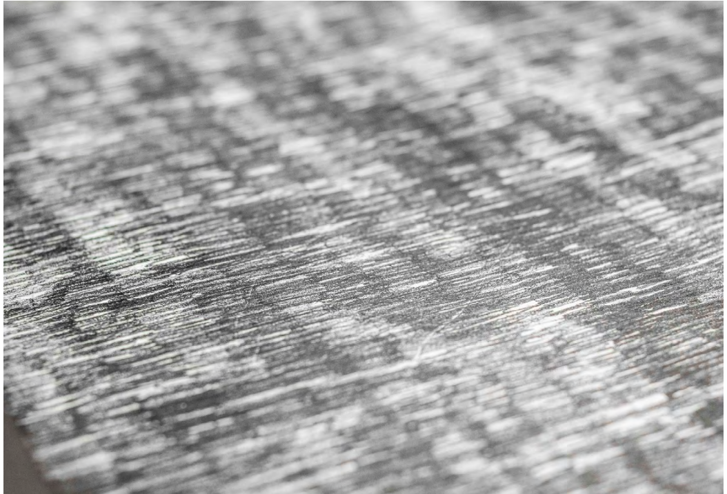
François Réau Mesurer le temps (detail), 2022, graphite on paper mounted on canvas, 82 x 125 cm

“Drawing is the trace, and the trace is as much memory as forgetting.”