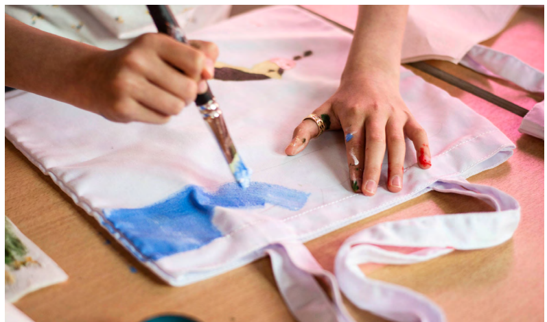
Bullu'kids Workshops, Exhibition « Oniric landscapes », 2022

Every last Saturday of every month and during school breaks. Price : 5 euros, on reservation : publics@bullukian.com