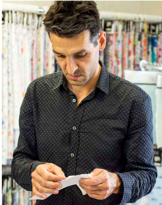
François Réau © Fondation Bullukian