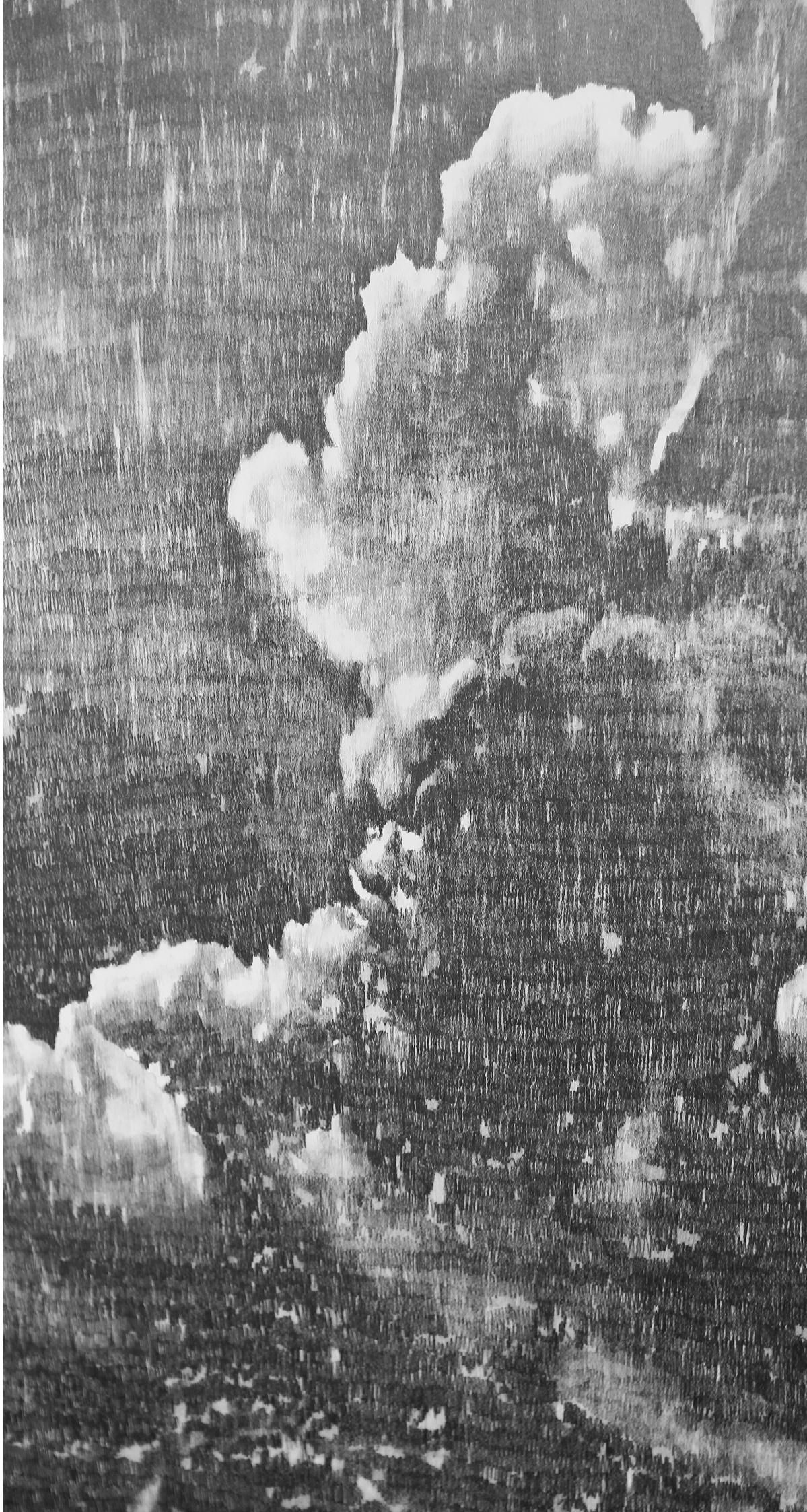
François Réau To what extent / Nuage (detail), 2022, graphite on paper mounted on canvas, 200 x 375 cm © François Réau