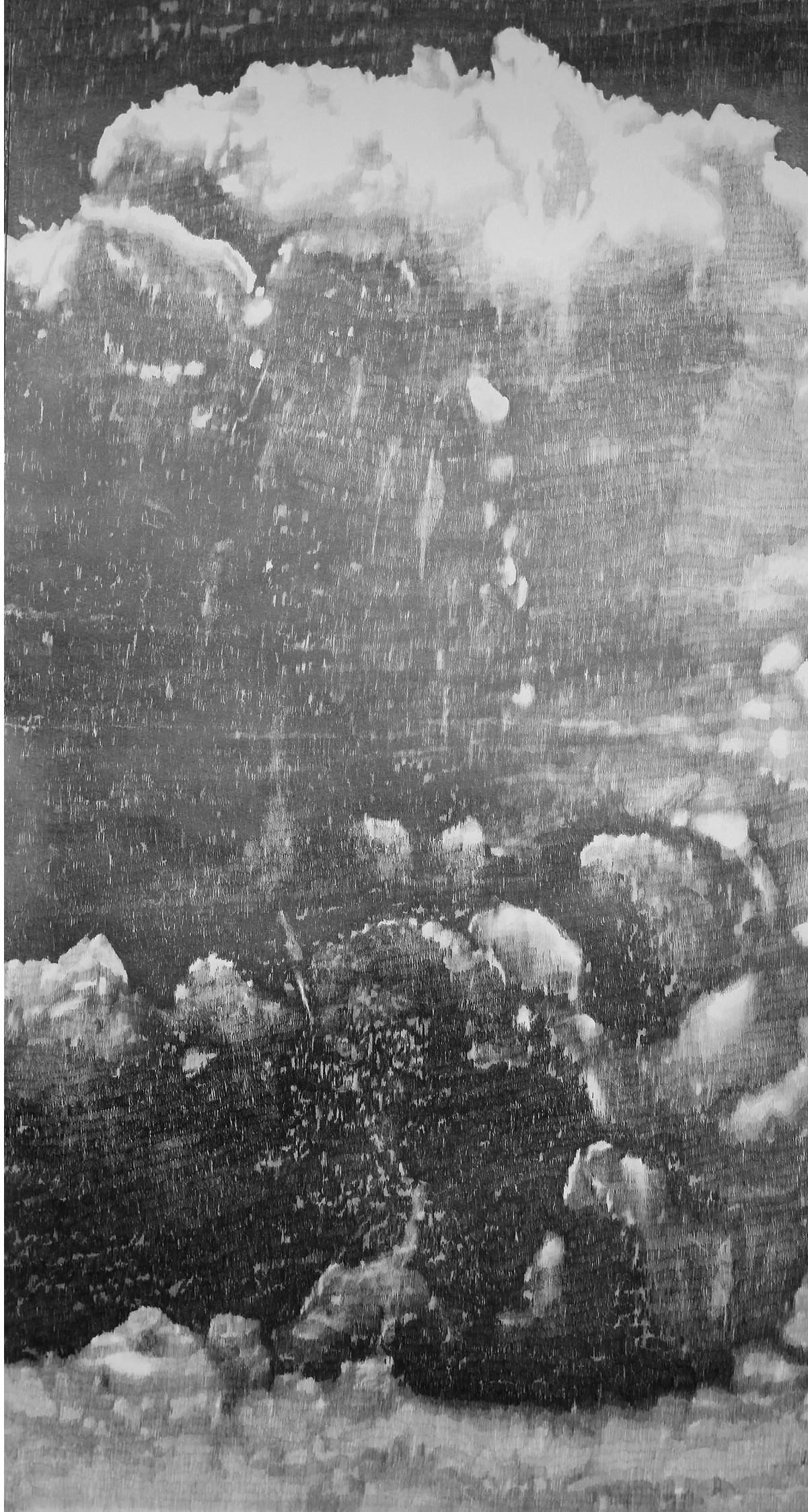
François Réau To what extent / Nuage (detail), 2022, graphite on paper mounted on canvas, 200 x 375 cm © François Réau